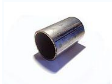
A short section of steel scaffold pole.

As well as timber, steel or aluminium decking is used. In recent years there has been a trend away from timber to steel or aluminium on account of timber boards rotting from the inside and is undetectable. Australian Scaffold does not use timber boards. As well as boards for the working platform there are sole boards which are placed beneath the scaffolding to spread the load over a greater area. An engineer's report may be required if the ground is soft or has recently been filled.